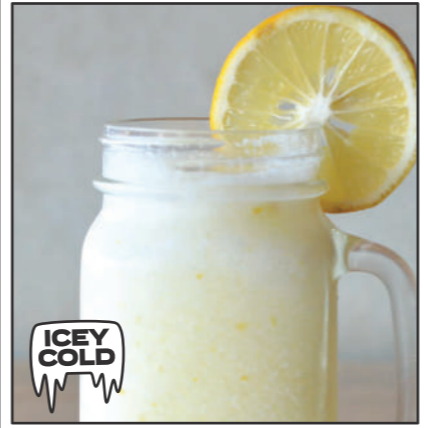
CITRON HONEY ..... $7.5