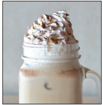
ICED COFFEE .....$5.5