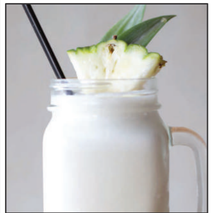
VIRGIN PINA COLADA..... $7.5