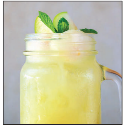
ROSEWATER WITH LYCHEE..... $7.5