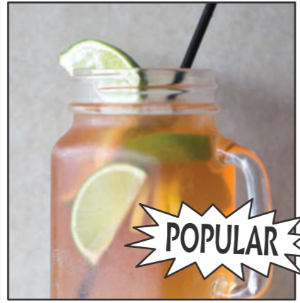
LEMON LIME BITTERS..... $6.5