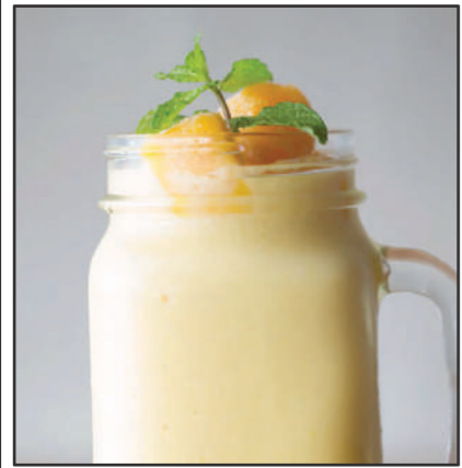
SUPER MANGO ..... $7.5