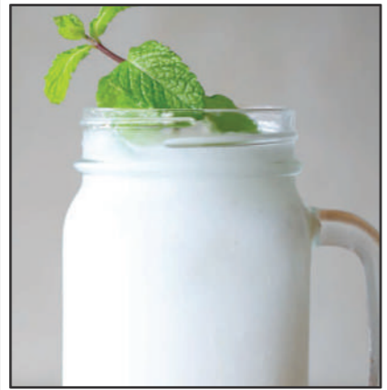
YOUNG COCONUT ..... $7.5