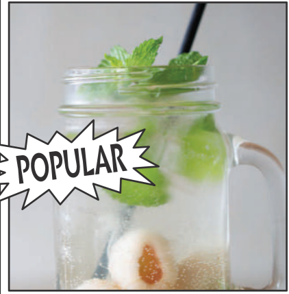
LYCHEE SODA..... $6.5