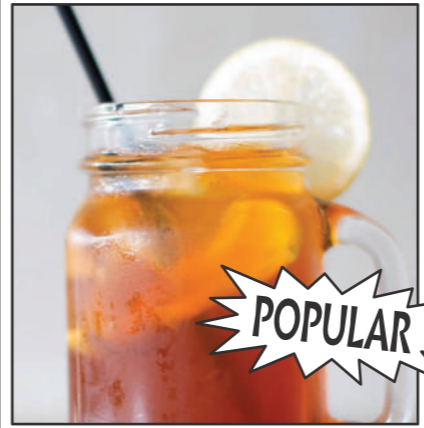
ICED LEMON TEA.....$5.5