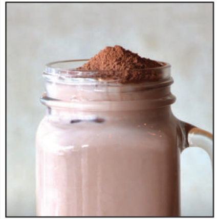
MILO DINOSAUR .....$5.5