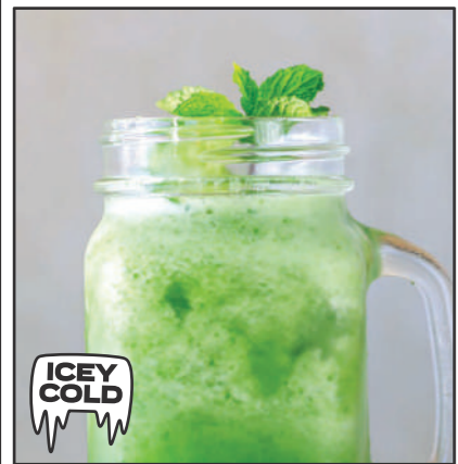
FROZEN MINT LEMONADE ..... $7.5